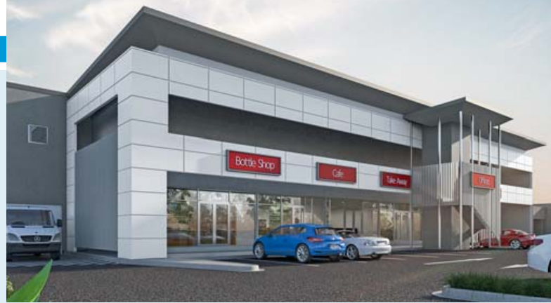
A $6.7 million retail centre is under construction in Griffin, north of Brisbane.