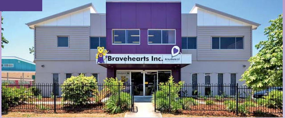
Bravehearts' newly expanded headquarters on the Gold Coast.

Despite this, the expansion was finished