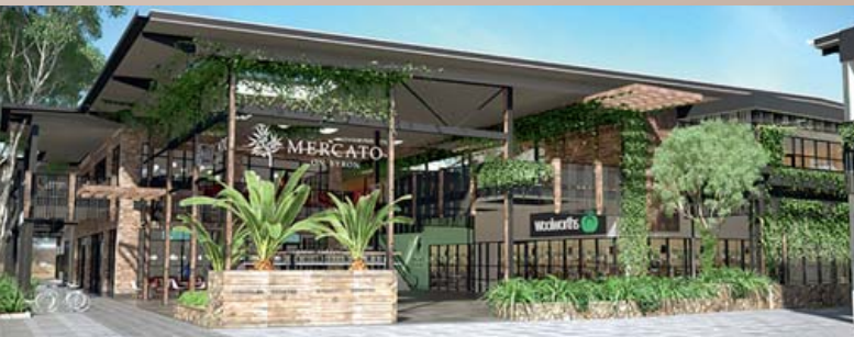
Mercato on Byron aims to be one of the country's first regional shopping complexes to achieve a five-star green star rating.

Built over two levels of shopping and entertainment, it will include a two-level basement carpark.