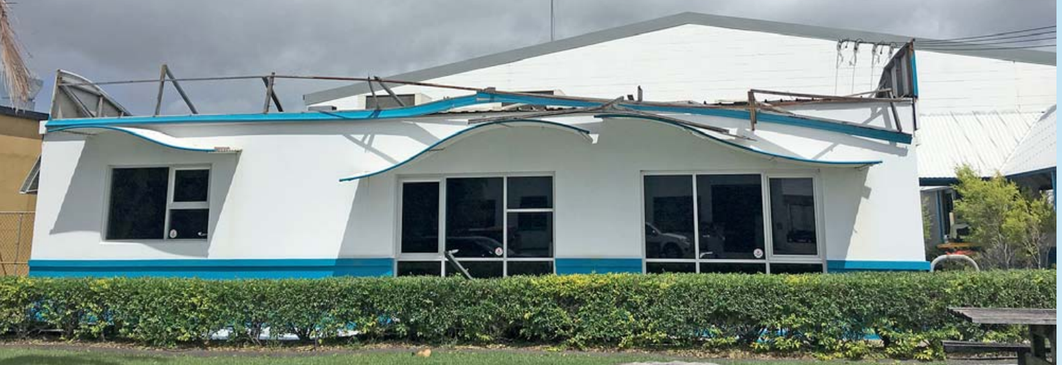
Hutchies' old office after ex-cyclone Debbie wreaked havoc at Tweed Heads.