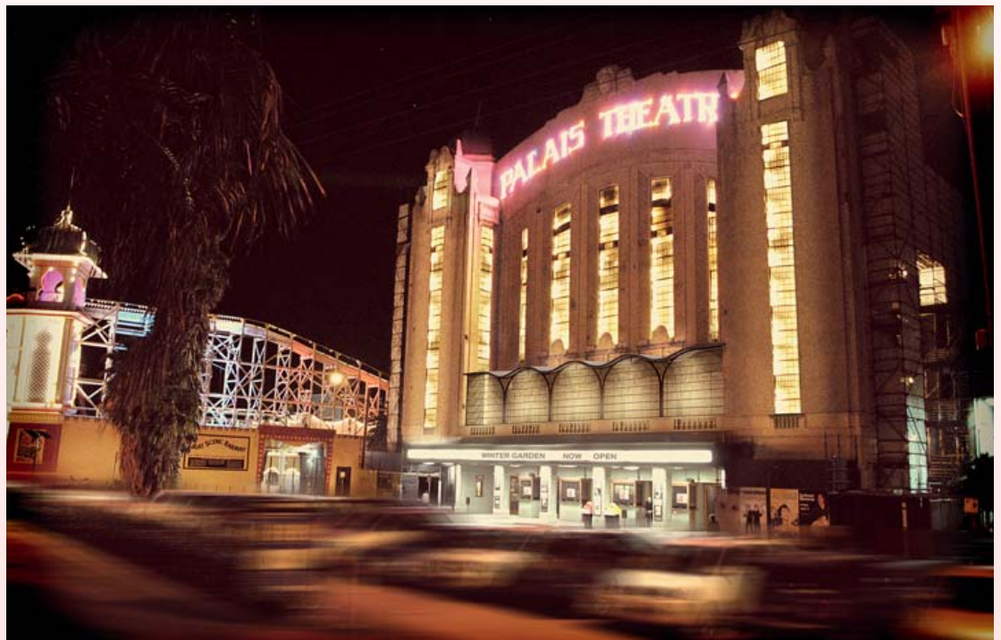
Melbourne's historic Palais Theatre is being refurbished by Hutchies.

The refurbishment will include new box office and cloak room, patch replacement of existing marble tiles, new candy bar, merchandise stand and café, new matching heritage carpet throughout, modifications to existing back of house dressing