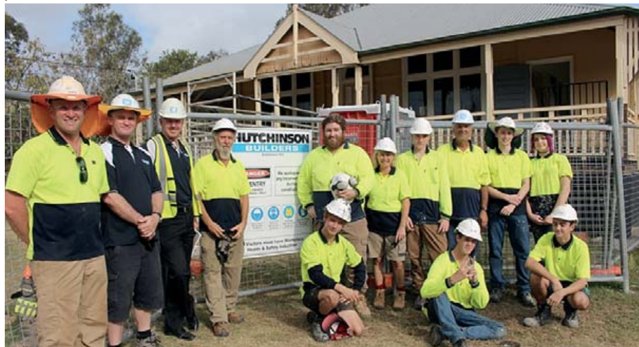
LEFT: Tradies and trainees outside the Tait-Duke Community Cottage in Tewantin.

Now known as the Tait-Duke Community Cottage, it will provide a meeting and activity space for a variety of community