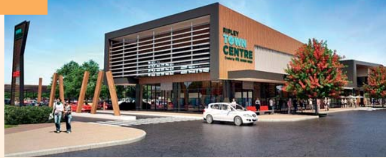
Artist's impression of Ripley town centre to service the Ripley Valley region in the western corridor of Ipswich.

Incorporating one of the largest integrated solar installations for a commercial retail outlet, the shopping centre will be a five-star green star design.