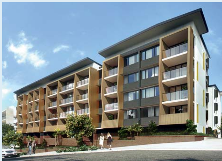
This five-storey residential development at Boggo Road, Dutton Park consists of 75 apartments over two adjoining buildings.