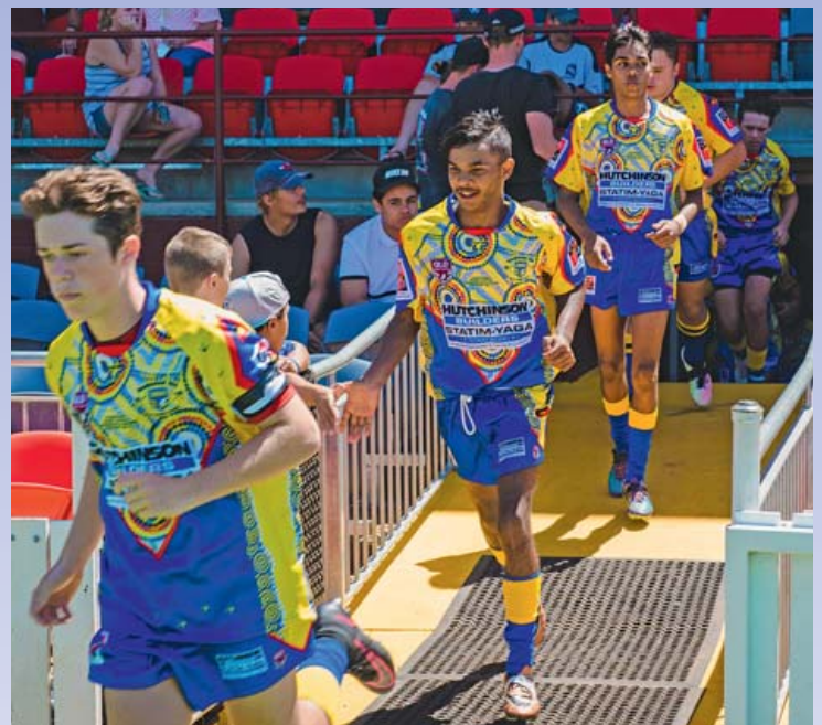
Indigenous footballers wearing Hutchies' Statim-Yaga colours running onto the field for the start of their game.