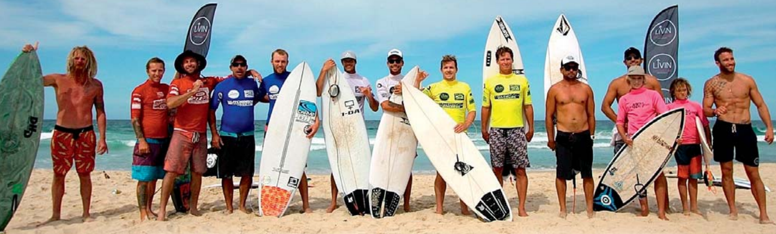
A line-up of some of the talent in the fourth annual Eager Beaver surf competition at Palm Beach on the Gold Coast.