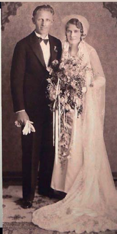
Tribute to Hutchinson Builders in the Museum of Brisbane, City Hall.